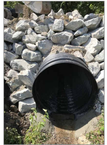
Trail damage photos from TribLive Westmoreland news report; photos of Westmoreland Road Crew taken by Malcolm Sias